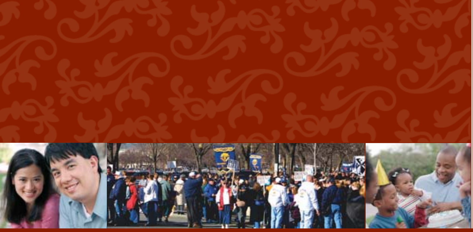
GUAM, GUATEMALA, PANAMA, CUBA, THE VIRGIN ISLANDS, THE BAHAMAS, AND SAIPAN